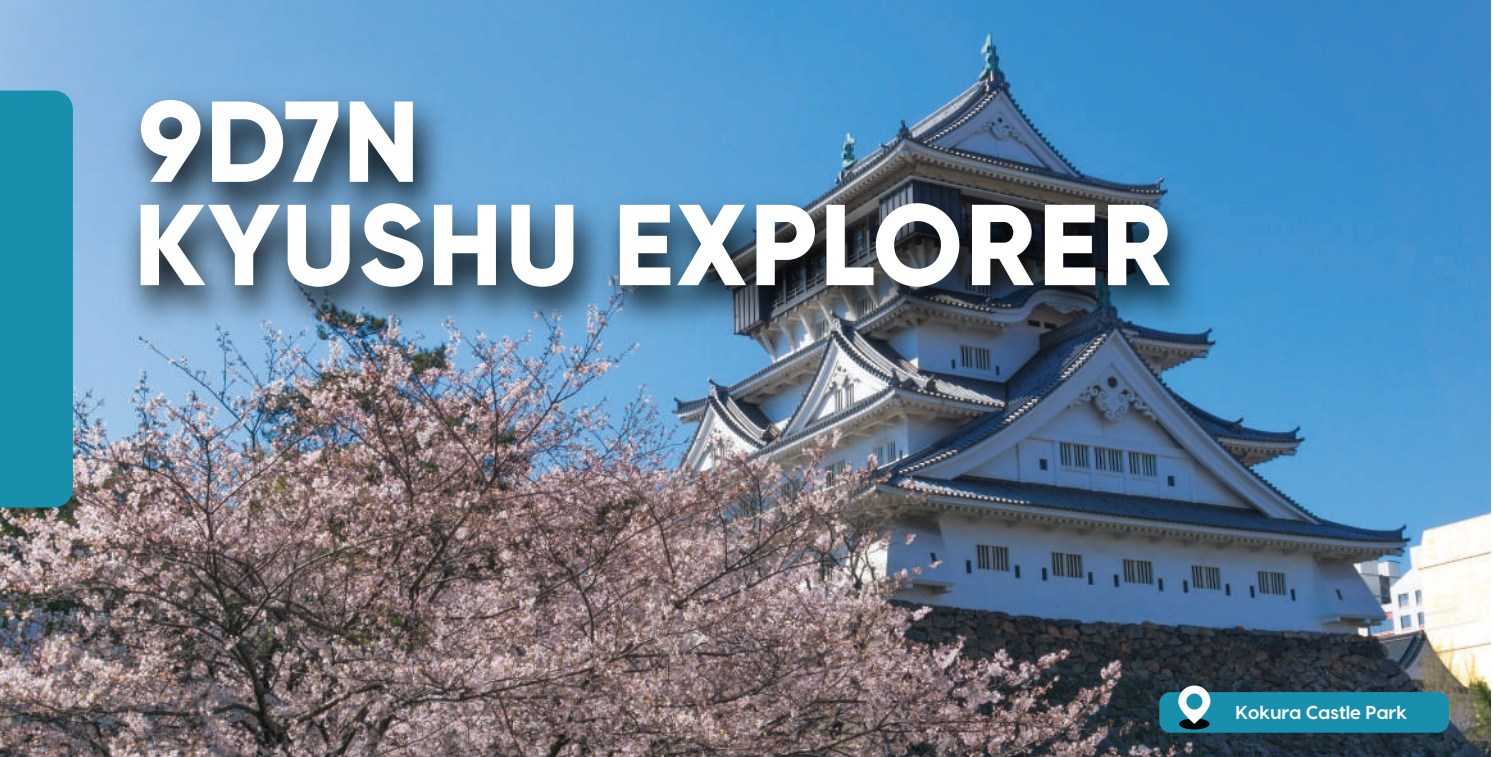
Kokura Castle Park