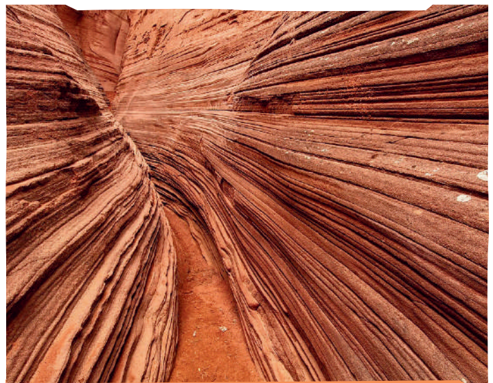
📍 China's Wave Valley

Local 4 +5* Hotel or similar, Free upgrade 1N international Hotel at Xi'an