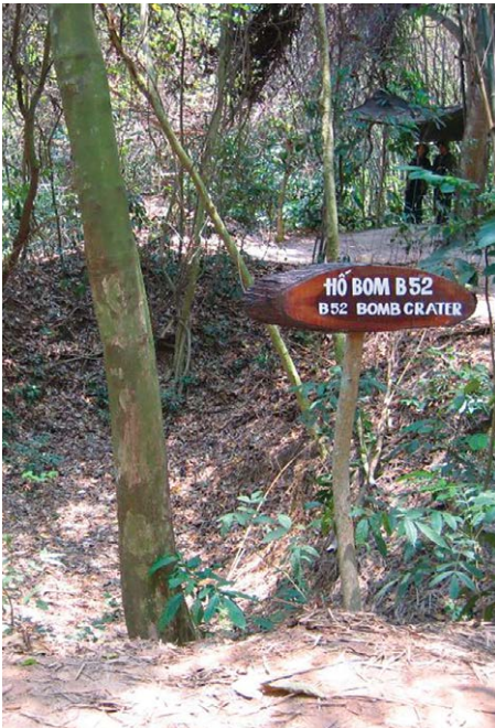
Cu Chi Tunnels