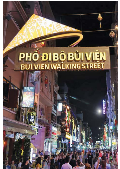
Bui Vien Street