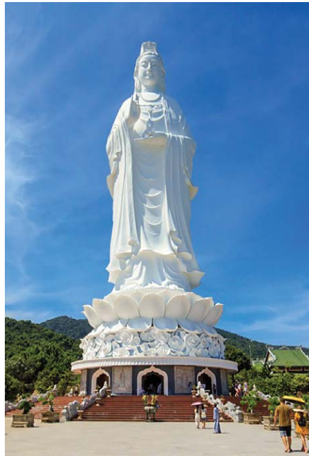
Son Tra Peninsula