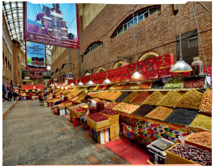
📍 Urumqi Grand International Bazaar