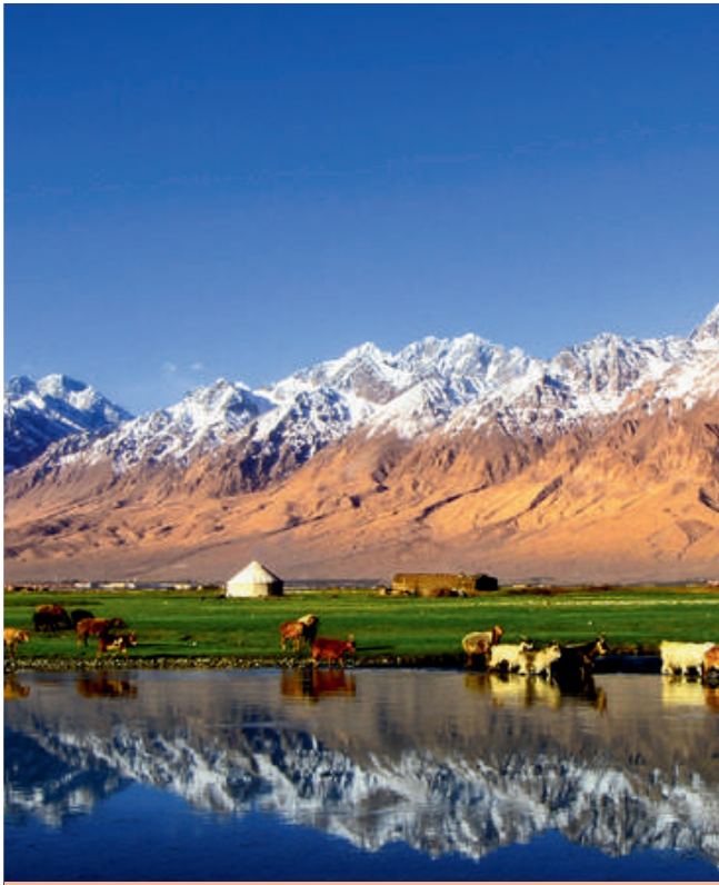
📍 Stone Fortress + Alar National Wetland Park

Day 10 | HOTAN – ALAR (6H) Breakfast, Lunch, Dinner