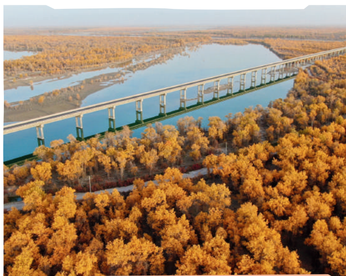
📍 Kalajun Kuoksu Grand Canyon

Accommodation: 4* Cultural Tourism Nalati Resort Hotel or similar