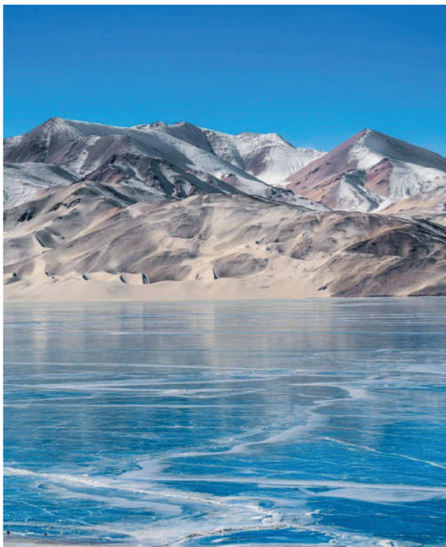
📍 White Sand Lake & White Sand Hill

Day 5 | KUQA – AKSU(3.5H) Breakfast, Lunch, Dinner