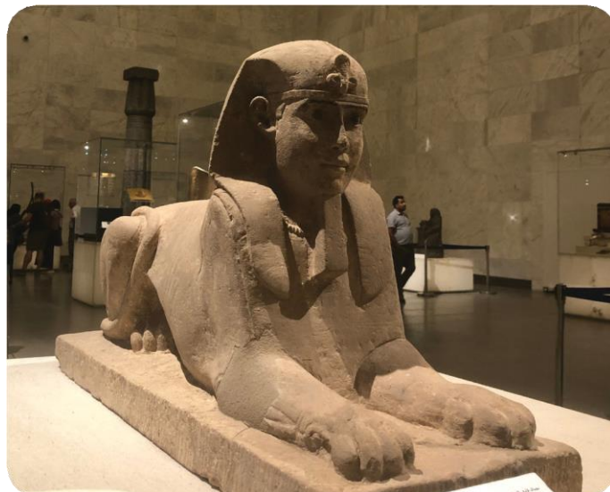
National Museum of Egyptian Civilization