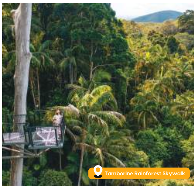
Tamborine Rainforest Skywalk

坦伯林雨林天空步道 ：漫步于坦伯林雨林的高架天空步道，欣赏周围茂密景色的壮丽美景。