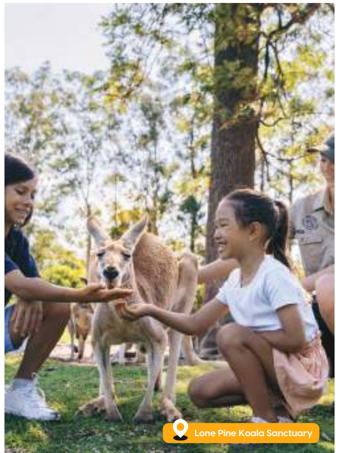
Lone Pine Koala Sanctuary

Western Dinner at Felons: Savor a delicious Western-style dinner at Felons, known for its riverside setting and vibrant atmosphere.