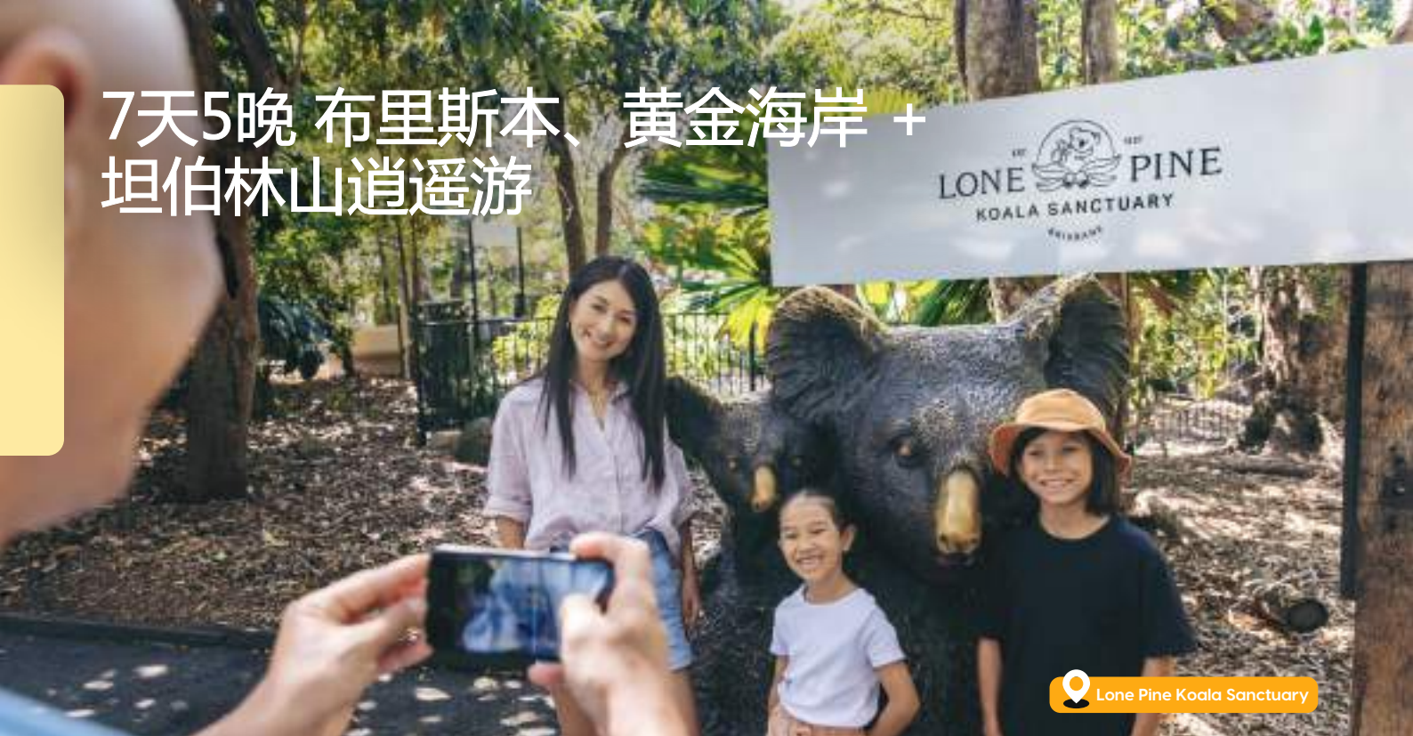
Lone Pine Koala Sanctuary