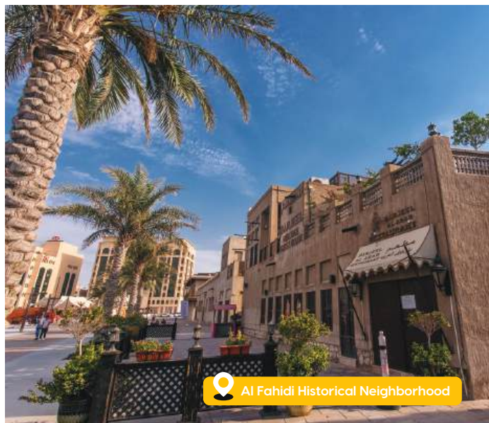
Al Fahidi Historical Neighborhood

自费项目: 吉普车沙漠探险 + 无限量烧烤晚餐 - 在沙漠中冲沙丘, 体验刺激的感觉。您还可以进行滑沙运动, 并从最高的沙漠沙丘上进行跳跃射击。观赏坦努拉和肚皮舞现场娱乐表演, 同时享受美味的烧烤自助餐