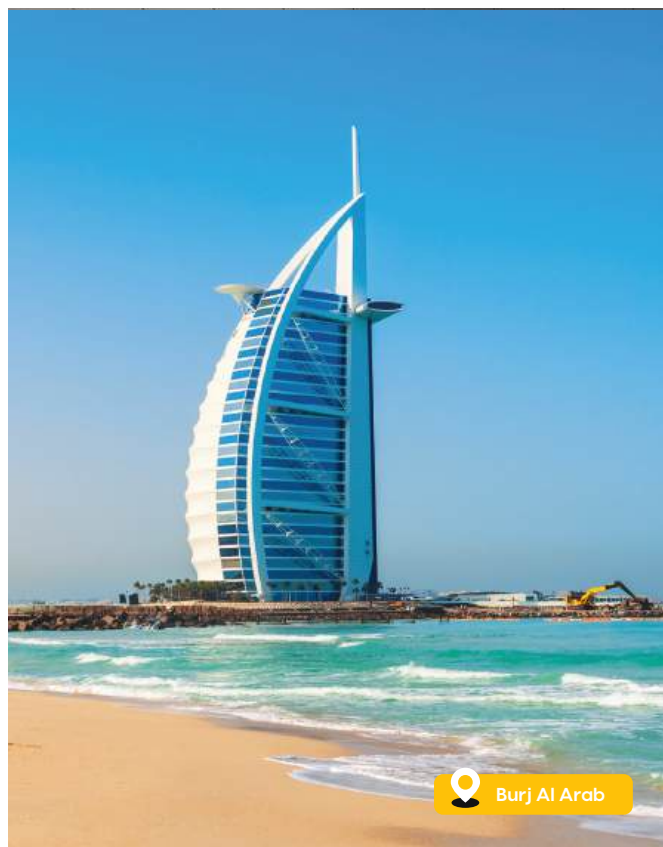
Burj Al Arab