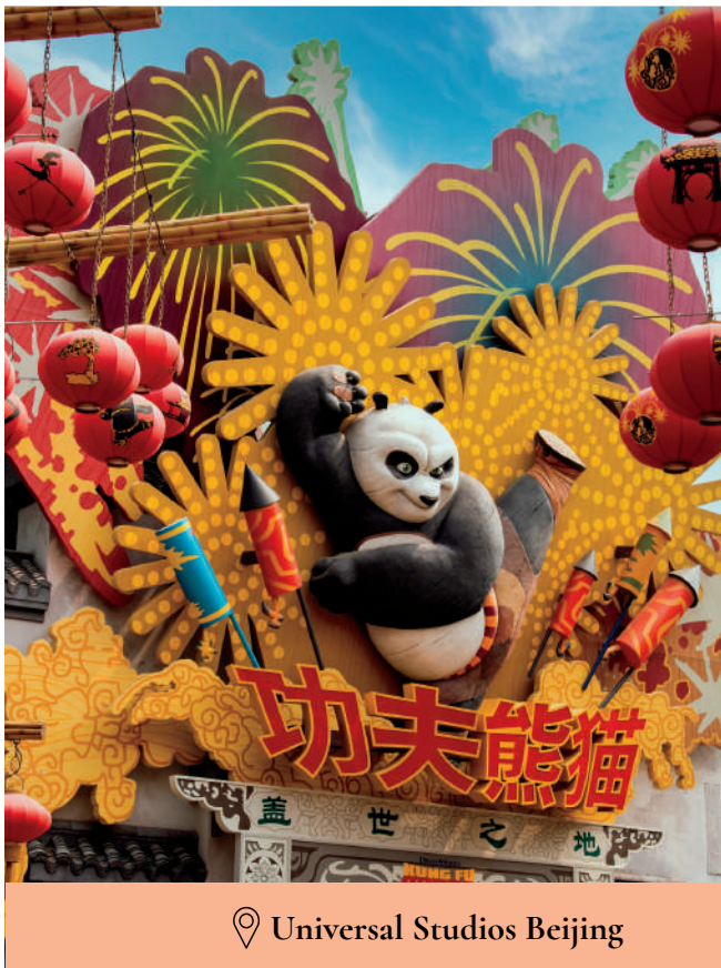
📍 Universal Studios Beijing