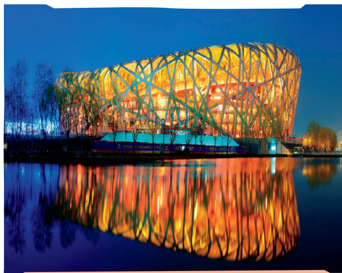
📍 Bird Nest

Tour leader (if any) - SGD $35/ per person