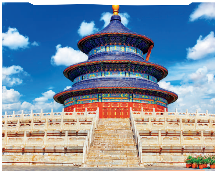
📍 Temple of Heaven

Accommodation: 5* Gubei Zhiguang Hot Spring Resort Hotel or 5* Gubei Water Town Grand Hotel or similar (10pax and above) (Gubei Water Town NO TRIP ROOM, must be book 01 Extra room, +SGD100/Per room per night)