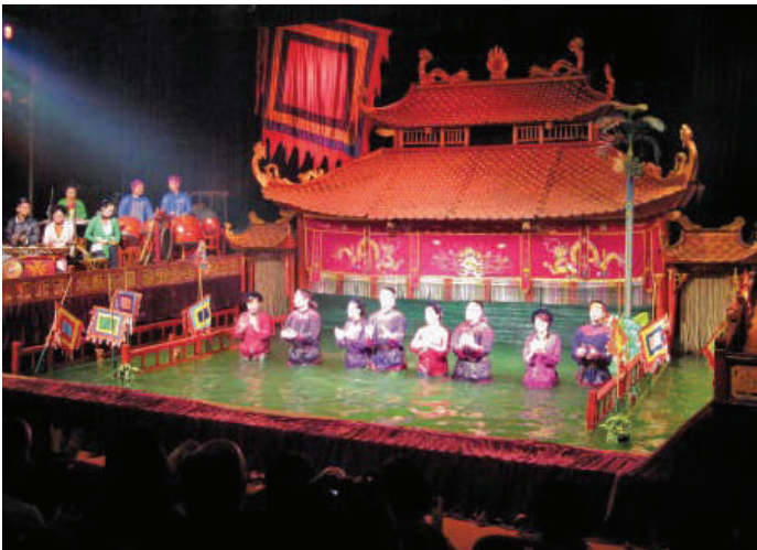
Ha Long Bay (Top)