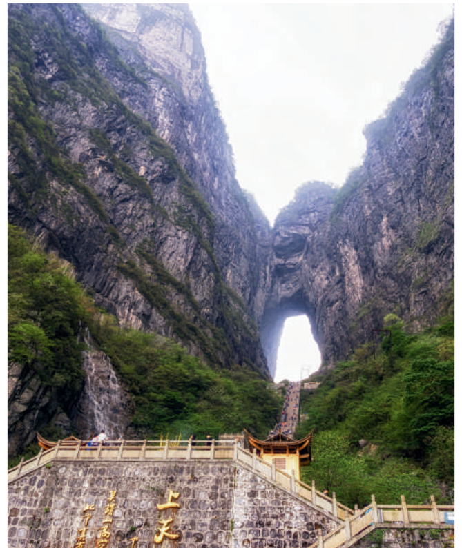
📍 Tianmen Cave

Day 1 | SINGAPORE ✈️ WUHAN Meals on Board,