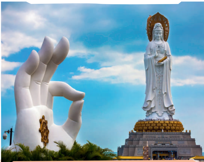
📍 108M tall giant statue of Kwan-yin