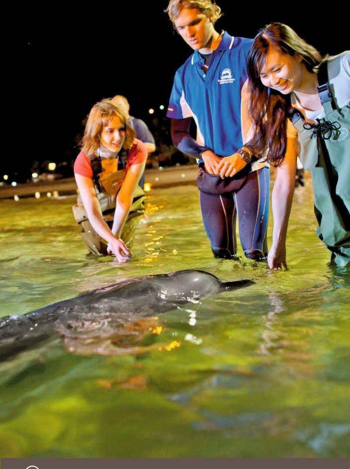
Wild Dolphine Feeding, Tangalooma