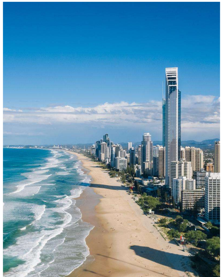
📍 Surfer's Paradise, Gold Coast